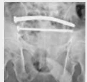
Patient 1: Postoperative