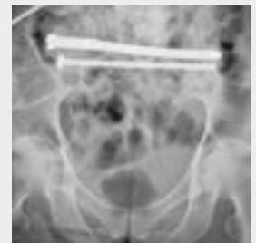
Patient 1: Postoperative