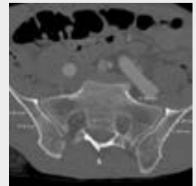
Patient 1: Preoperative CT

Patient 2 was fully weight bearing at 10 weeks with minimal pain in the pelvis.