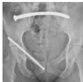
Patient 2: 10-week follow-up