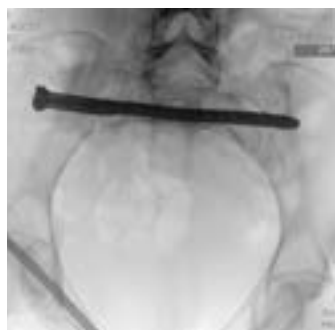
Patient 2: Postoperative